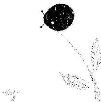
Spring Is In The Air

To date we have acquired $725,000 for the Sewer Separation Project through grant money and we are continuing to explore the possibilities for additional funding.